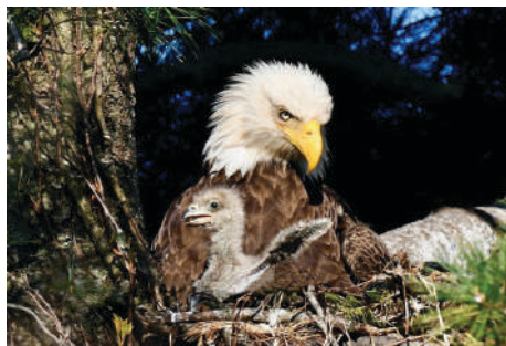
Bald Eagles Born & Bred in Nassau County by Jay Koolpix

Several other species adapted to human spaces when their natural breeding habitats were destroyed due to deforestation, agriculture,