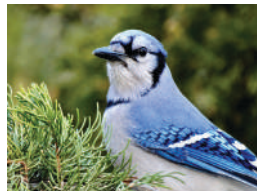
Blue Jay

What’s with this Blue Jay? His Chicago brethren would be ashamed of him. ♦