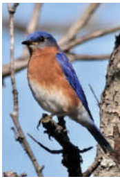
Eastern Bluebird by Bill Belford

The final budget provides an additional $500 million in funding for water quality and clean water infrastructure,