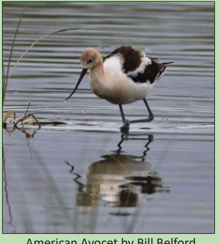
American Avocet