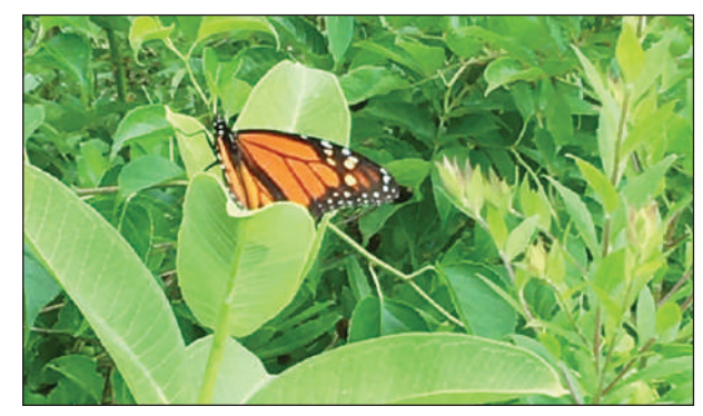
Monarch Butterfly on Milkweed

As part of the Audubon Bird-Friendly Communities initiative, SSAS maintains three native plant sites. Volunteer with us!