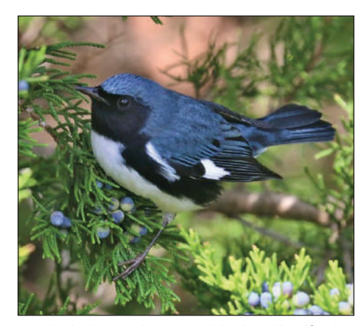
Black-Throated Blue Warbler by Bill Belford

Receive the quarterly South Shore Skimmer to know what's happening. Keep apprised of our events and local conservation activities to help us all live a greener life.